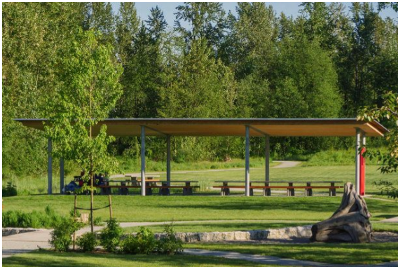
a wooden structure in a park