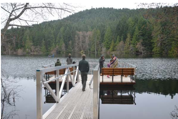
a group of people standing on a dock over a body of water