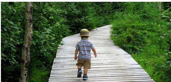
a boy walking on a wooden bridge